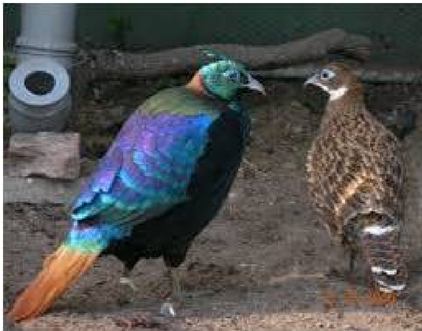
Himalayan Monal / Lophophorus impejanus